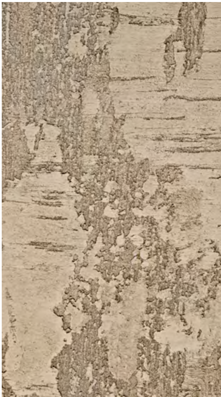
ARCHI+ CONCRETE BIANCO/WHITE & FASE SILOSSANICA 6101 (2 mani/layers)