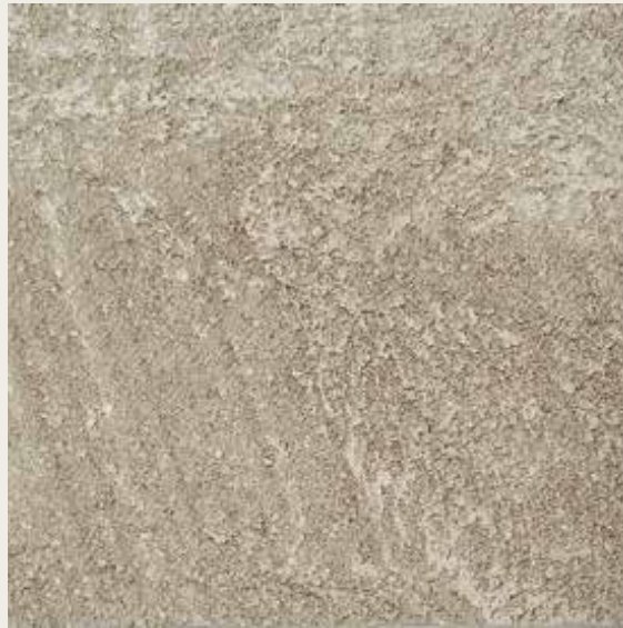
CONCRETE by Novacolor 4654 PC 2010 & FS 6101 & FS 6110