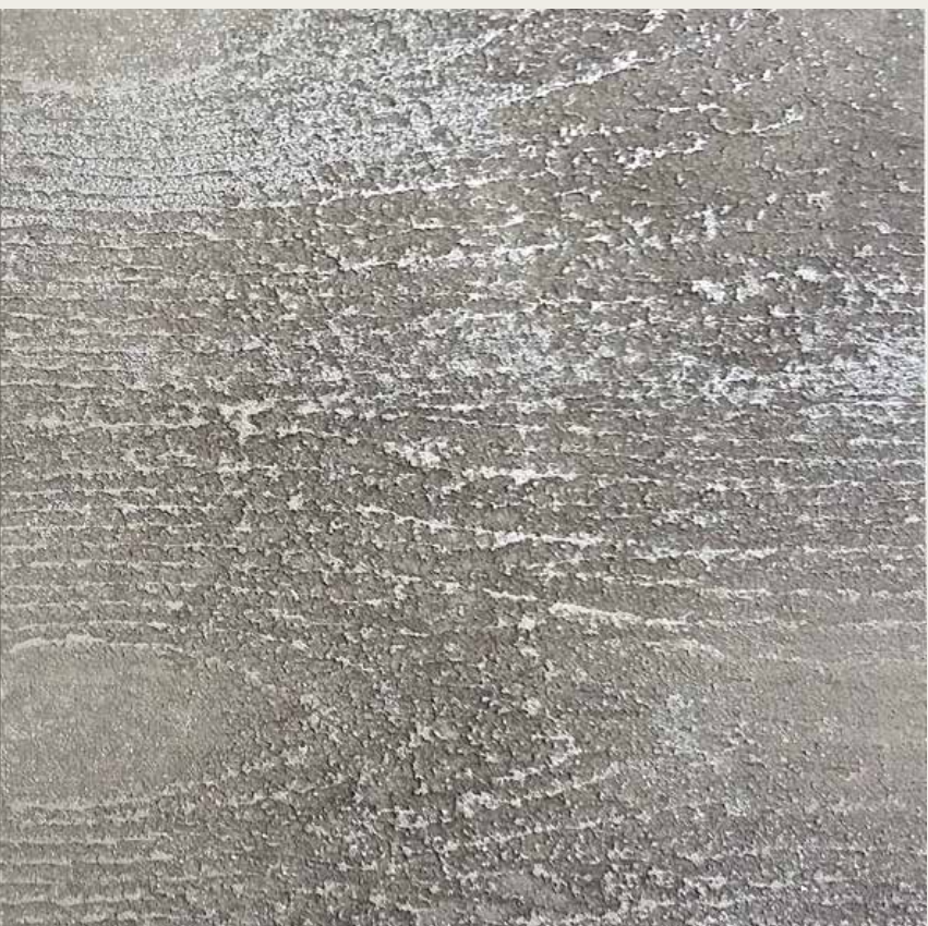
CONCRETE by Novacolor 4654 PC201.0 & FASE SILOSSANICA PS 610.1 & RUSTON METAL SILVER

Egebildgkeit: 1,6-2 Kg/m 2 in zwei Schichten. Für weitere Infos bitte siehe Technisches Merkblatt.