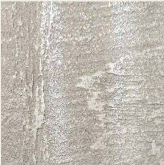
CONCRETE by Novacolor BIANCO & FS 6101 & RUSTON METAL SILVER