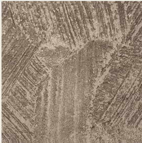
CONCRETE by Novacolor 17007 & FS 6112